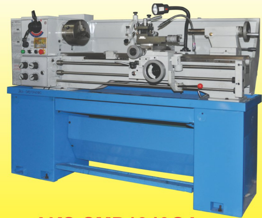
AKS-SMD1340GA PRECISION GEAR HEAD LATHE MADE IN CHINA 中國制造