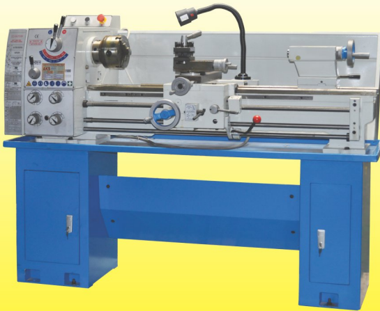
AKS-XI1340GA PRECISION GEAR HEAD LATHE MADE IN CHINA 中國制造